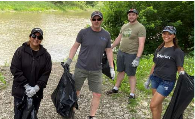
Volunteer groups pick up trash, being good stewards of the Red River. It is a fun teambuilding experience that instills a sense of community pride, allows volunteers to get fresh air and exercise, spend time with friends and family, and enjoy the Red River.