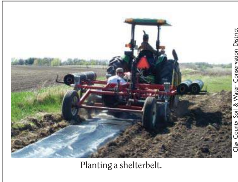
Planting a shelterbelt.

Clay County Soil & Water Conservation District