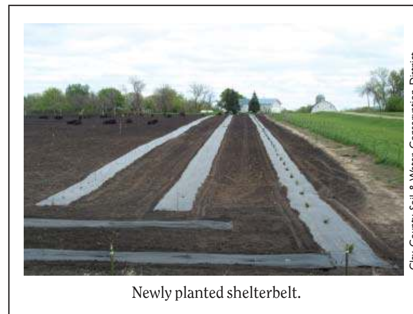
Newly planted shelterbelt.

Clay County Soil & Water Conservation District