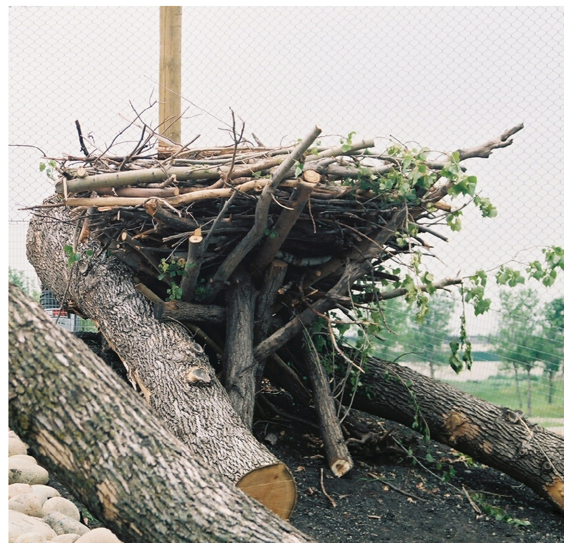
Red River Zoo

Endangered Species: Prior to the 1800's, the bald eagle population was estimated near 250,000 and could be found in nearly every state in the country. As the human population increased, the eagle population decreased. Eagles have been the victim of shooting, poisoning, egg collecting, habitat loss, and most recently, chemical contamination. Their numbers were at an all time low in the 1970's due to the pesticide DDT. The toxins from this chemical would build up in the tissue of fish, the eagle's primary food source, and eventually accumulate in the eagle's body. Reproduction was impaired because the toxins reduced the thickness of the eagle's eggs. As a result, the eggs would break under the weight of the adults during incubation. Bald eagles were fully listed under the Endangered Species Act in 1978. The population has made a dramatic comeback due to habitat