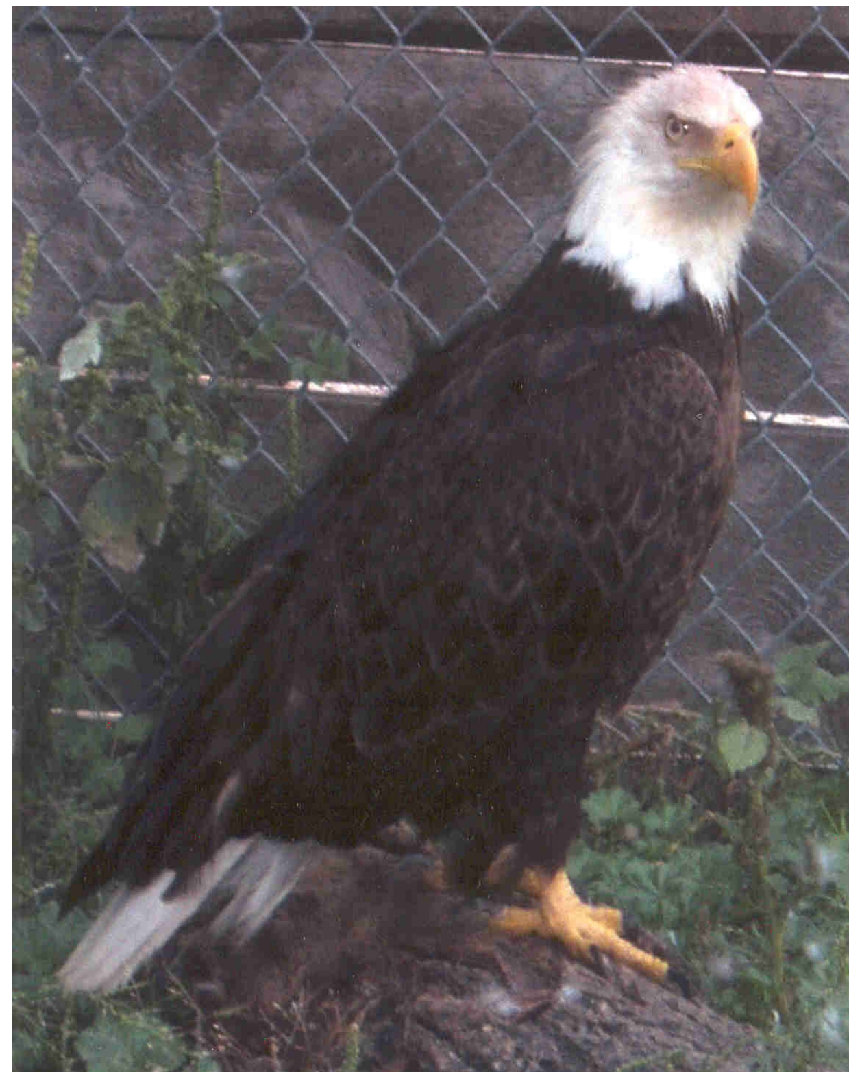
Red River Zoo

Visit this bald eagle at the Red River Zoo in Fargo, North Dakota.