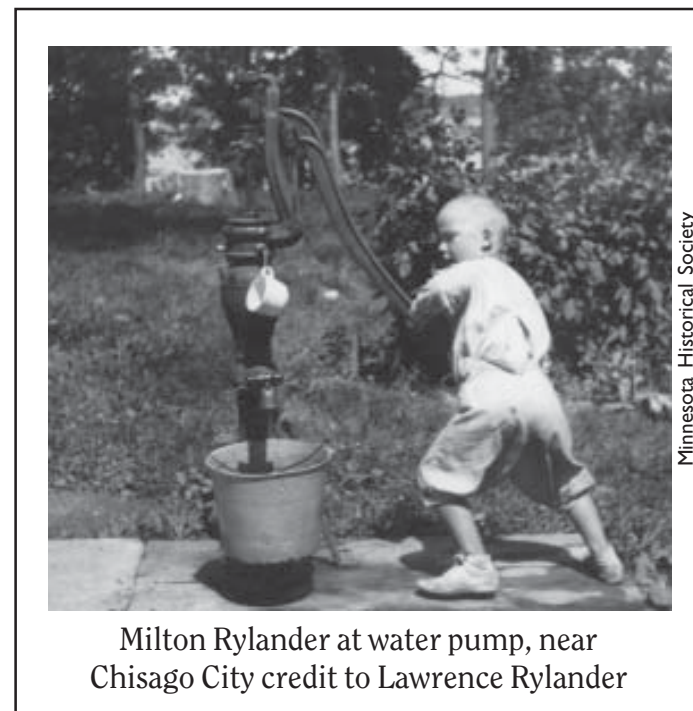
Minnesota Historical Society

Some aquifers are large and others small. Pumping too much water, too fast can cause water shortages in other wells drilled in to the same aquifer. Precipitation (rain or melting snow) adds water (recharge) to the spaces in the rocks.