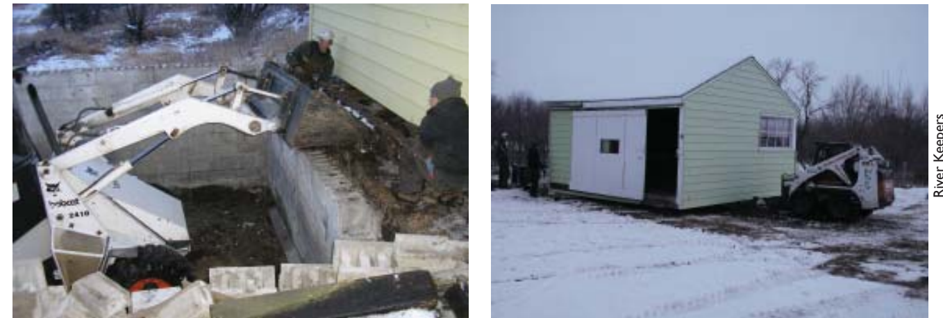
Moving the Info Center.

Land that borders these outside meander loops is unstable. Look around the Living Lab. There are many examples here of “slumping” that has occurred because the Lab is on the outside of the meander loop. The Info Center had to be moved to its current location in early 2007. Its foundation was collapsing because of the unstable soil. It used to be located closer to the river. If you were going to build a house in the Red River Valley would you build it on the outside loop of a meander?