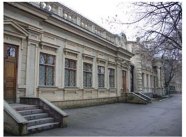
The Natural and History Museum of the City of Bendery.

Today the Museum of Fighting Glory is located in the Village Palace of Culture; it was located there after the Chitcani monastery became operational. The museum's display tells about the preparation and the