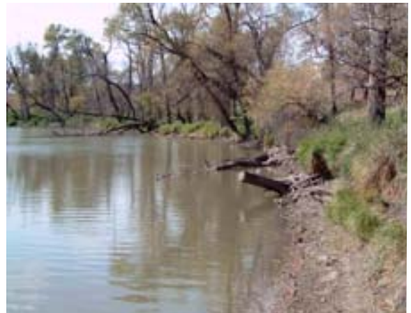
Hanson Design Associates

Efforts this year will include: trees will be planted along the first 50 feet of the riparian area to begin the riverfront restoration, a storm water and how residents affect water quality interpretive display will be designed